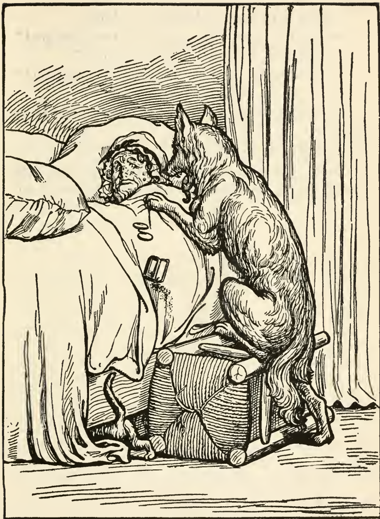
"HE FELL UPON THE GOOD WOMAN."